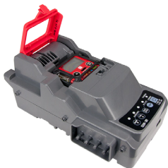
Calibration Station SDM-3R